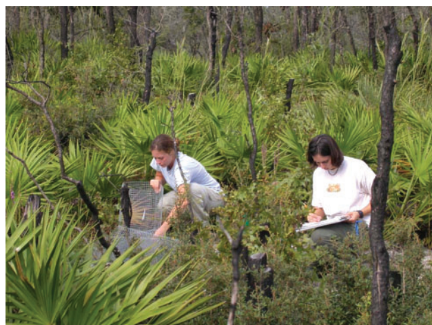
Fig. 1. Narrow central Florida scrub endemic Ziziphus celata , protected from herbivory by cages at an introduction site, being monitored for growth and survival. Introduced populations are being designed with propagules from multiple wild populations in order to overcome breeding-system limitations imposed by cross-incompatibility and limited genetic variation (Weekley et al. 2002).

A key qualitative measure of the ultimate fate of translocations is the ability of transplants to flower and set fruit, often considered a